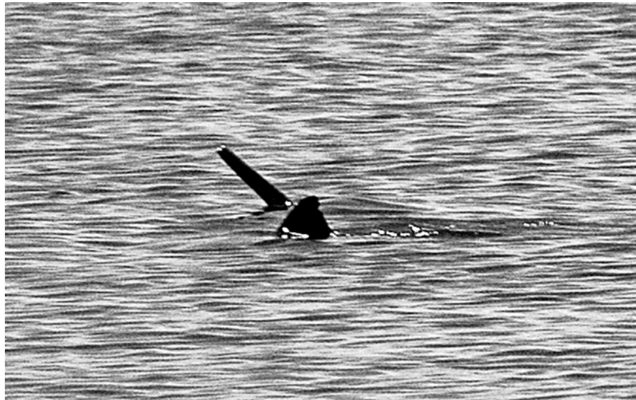
Figure 2. Two sighted adult franciscana dolphins ( P. blainvillei ) in the Cananéia estuary.

Cananéia estuary. Efforts should be continued in order to evaluate possible sightings in the future.